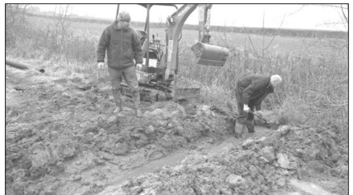
Digging the Ditch